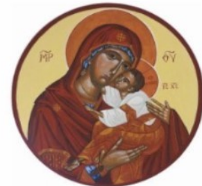
Mother of God (Tenderness)